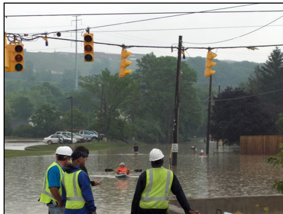
See the kayak?

Fosdick Road at about 11:30 a.m. June 23, 2006