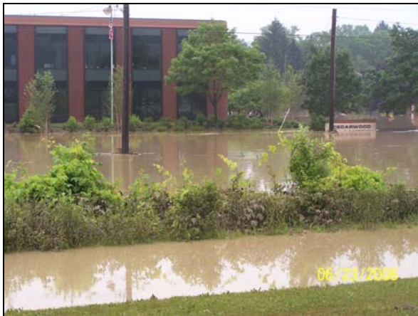
Even the bike path was under water.

Here are a few pictures for you to look at to see the damage the flood caused. These outside ones were taken about 9:30 a.m. on Friday the 23 rd from W. Canal Road.