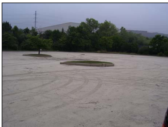
This is the parking lot covered with mud!