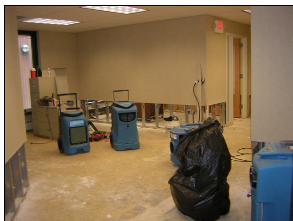
The walls were cut and dryers were placed in the suites to dry out the walls.