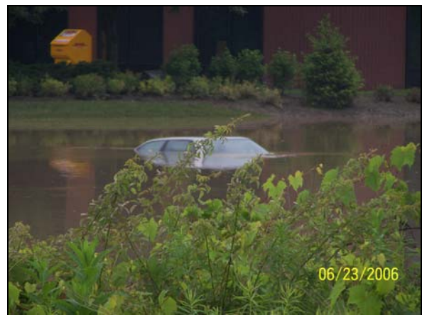
A car is floating!

Fosdick Road at about 11:30 a.m. June 23, 2006